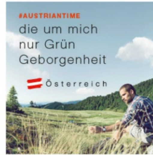
250 x 250 px

If the banner size is too small to depict the hashtag, the headline and the logo, the content is reduced to the image, the logo and the hashtag.