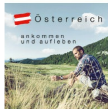
200 x 200 px