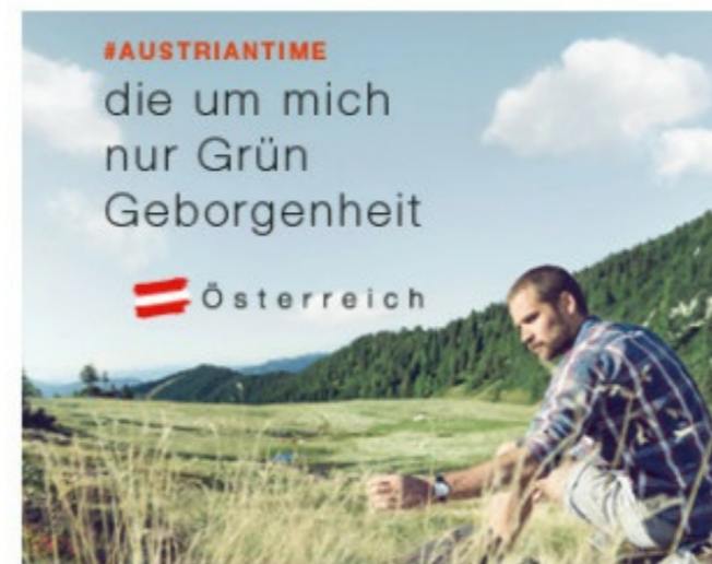
300 x 250 px