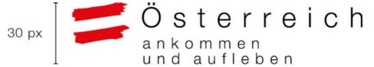
Mindestgröße B2C-Logo mit Claim

The guidelines defined for print advertising also apply to all online uses. Only the minimum size of the logo was optimised for online use.